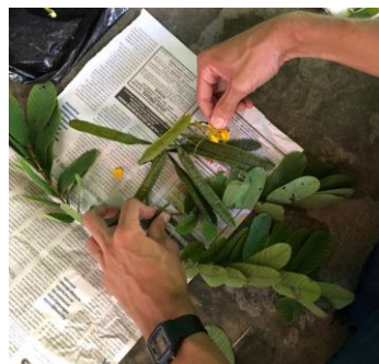
Figure 2. Botanical collection of S. reticulata .

For this research botanical collections (Figure 2) and the identification of the species S. reticulata were realized according to traditional techniques in plant taxonomy (Martins-da-Silva et al., 2014), on 18 September 2019, in the Research Campus of Museu Paraense Emílio Goeldi, in the city Belém from the Pará state, Amazonia, Brazil, the geographic coordinates of 01°27'04" (S) and 48°26'47" (W). A sample was selected for registration and identified and incorporated as an exsiccate in the in the Herbarium of the Museu Paraense Emílio Goeldi (MG) under the registration MG 233276.